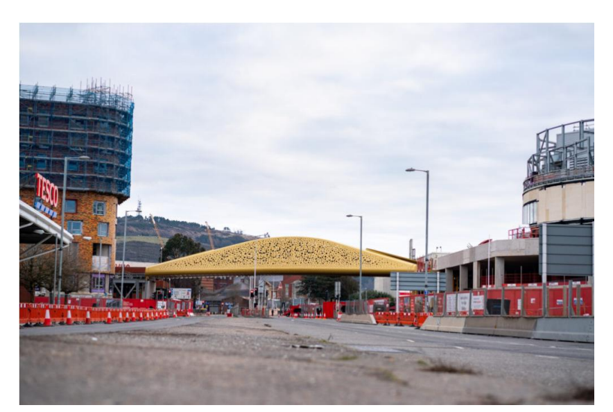
Arena - cladding / LED's being installed

Delivery of outputs likely to be affected by Covid-19